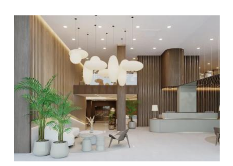
Room Included 4 Star In Antalya Breakfast